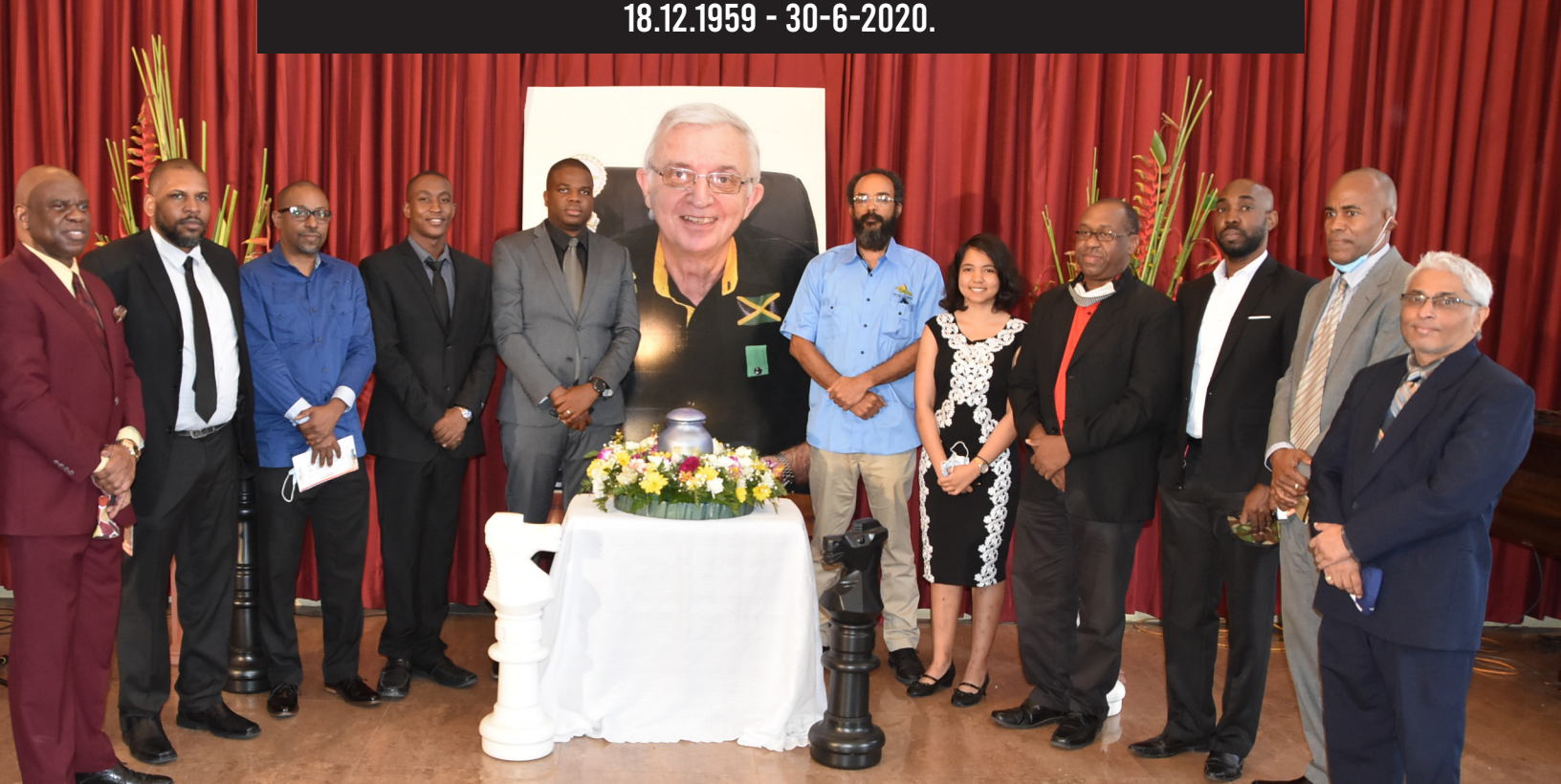
(left - right)