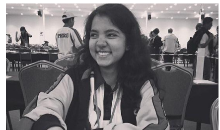
World Youth Chess Championships Greece, 2015